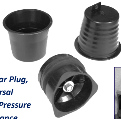
Regular Plug, Universal Plug, Pressure Resistance

GS Industries of Bassett's Underground Products pioneered in engineering the first plastic spacer system. We offer a complete line to construction companies, civil engineers, developers and utility companies. Our spacers withstand rough handling and heavy loading, are UV stabilized and resist chemicals such as aqueous acids, alkalis, salts and mineral oil.