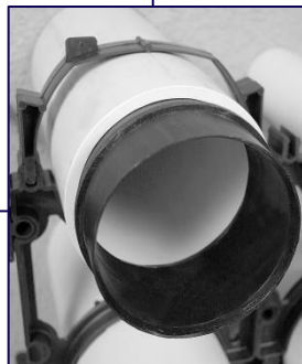
Coupling – allows for pipes to be joined.