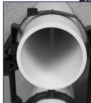
Cap Strap – used to cap duct bank