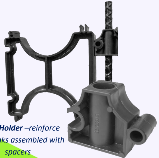
Rebar Holder –reinforce duct banks assembled with spacers